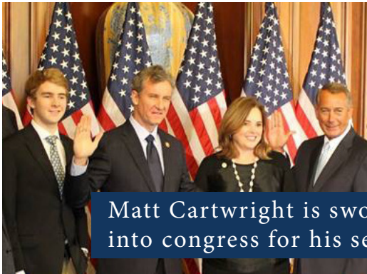
Matt Cartwright is sworn into congress for his second term.