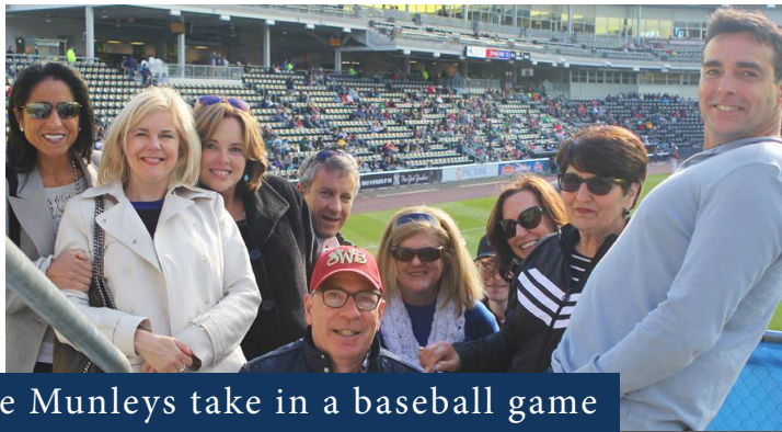
The Munleys take in a baseball game for some quality family time.